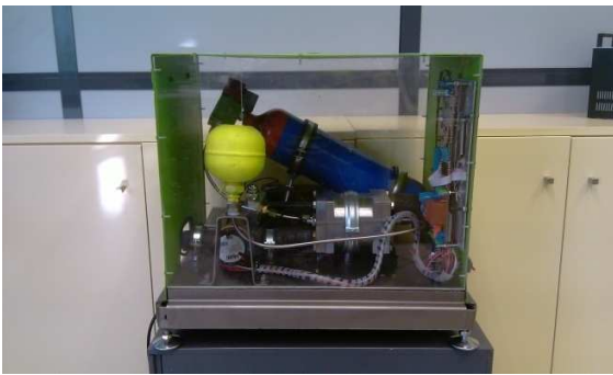
Hyperion C pre-industrial prototype (Casing, isolations and security components omitted)